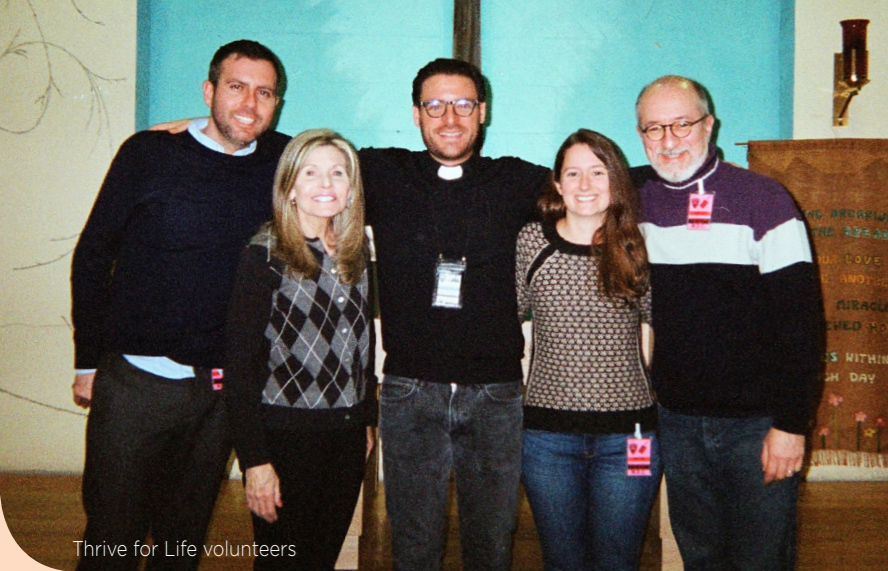
Thrive for Life volunteers